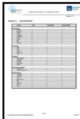
Summary Results Page